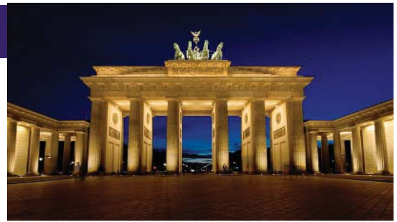
Berlin's Brandenburg Gate

the growth of the Prussian state as an important player in European politics and the dominant state in a unified Germany. A Francophile, Sanssouci reflects Frederick's desire to build his own version of Versailles. We will tour the main palace and grounds and also visit the Cecilienhof, where Truman, Churchill and Stalin signed the agreement in August 1945 to divide up the spoils of Europe after the war. We return to Berlin for a late afternoon duo recital by Daniel Barenboim and fellow Argentinean pianist, Martha Argerich.