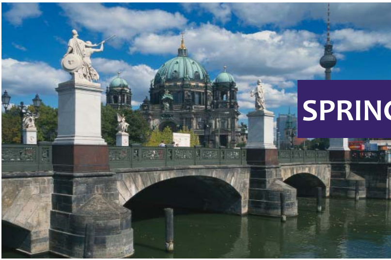
Berlin Palace Bridge and Cathedral